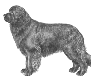
Newfoundland Cousin breed