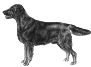
Flat-Coated Retriever Sibling breed