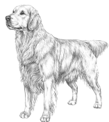
Golden Retriever Sibling breed