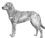
Chesapeake Bay Retriever Cousin breed